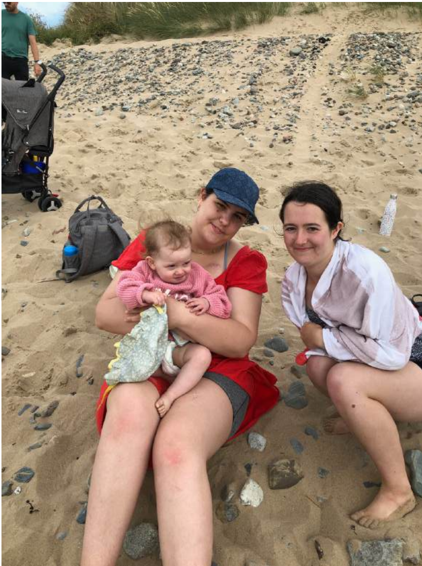
In search of the hills